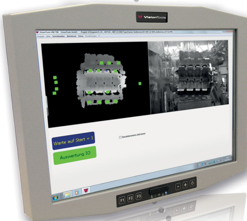
Slybox V - TP-15, 15" Touchpanel